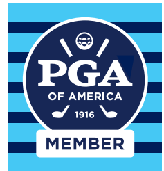
WHITE FILLED NAVY