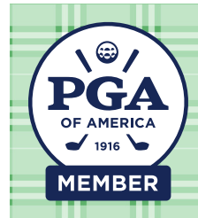
NAVY FILLED WHITE