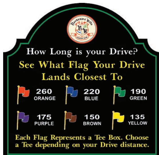
BERKSHIRE HILLS PRACTICE RANGE SIGN

Once traditional tee colors are changed, players will begin to better understand which tee markers they should play. One way to speed up your customers’ understanding is to place on the practice range flags that correspond to the tee colors with a sign, such as this one from the Berkshire Hills practice range in Chesterland, Ohio.